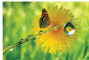
Aberration neutral Optima VUE Hydrophobic aspheric Foldable excellent visual performance under low light