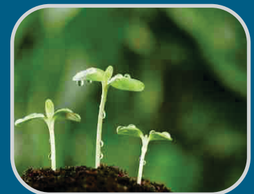
Aberration neutral OPTIMA Foldable excellent visual performance under low light

○ Aberration neutral aspheric lenses are designed with uniform power from center to edge